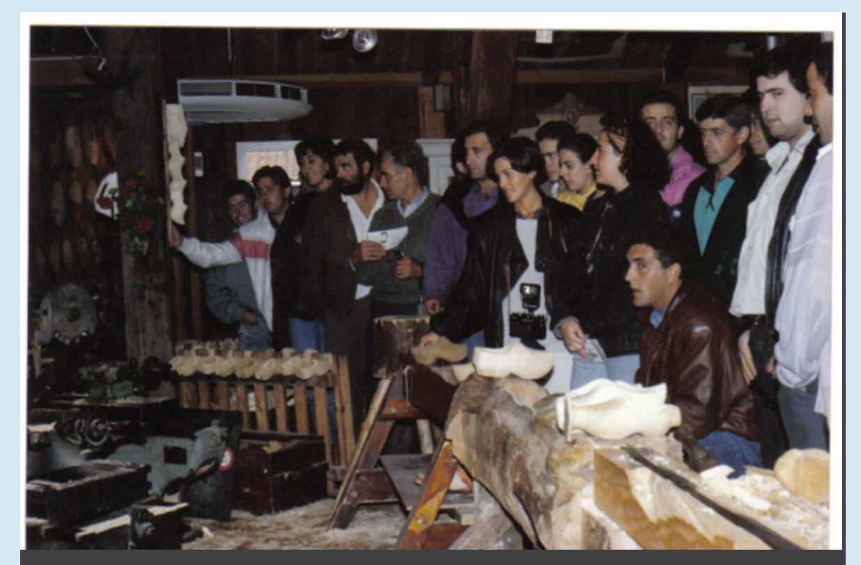
Looks like a fun trip to a Klompenfabriek somewhere in the Netherlands! Recognise anyone in the photo? Let us know!