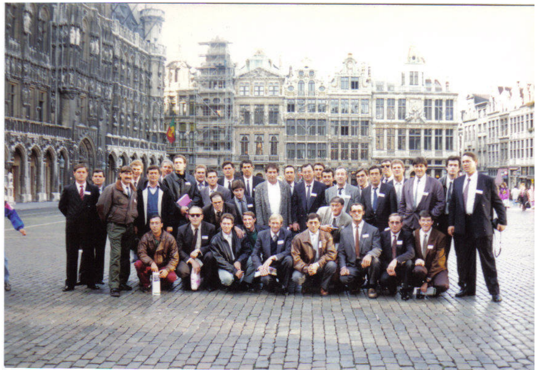
CEJA celebrates its 60th birthday this year and we're already looking forward to the party