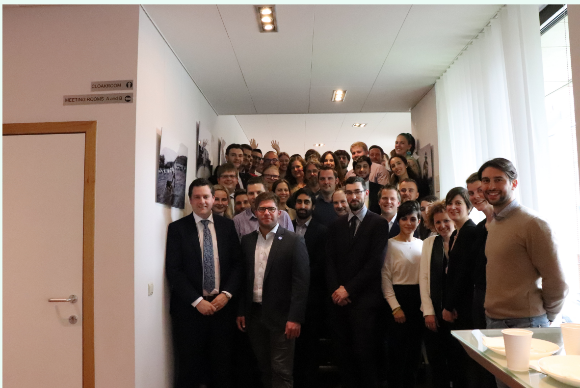
Young farmers from across the EU attended CEJA's annual Presidium in Brussels this week